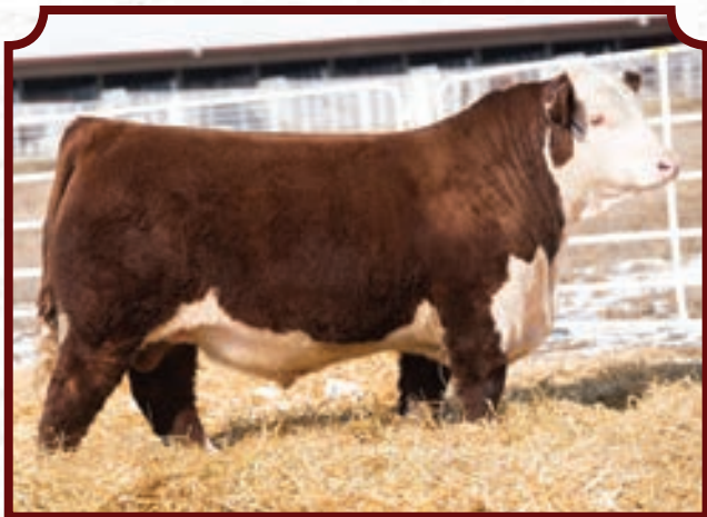
TH 13Y 358C BOTTOM LINE 206E