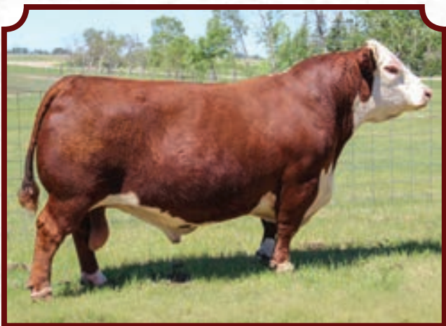
TH 745A 7B START ME UP 71D