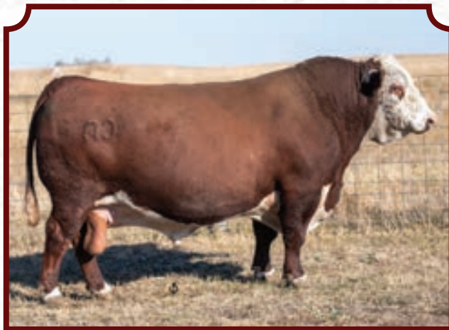
GHC C5 ATTENTION 155E