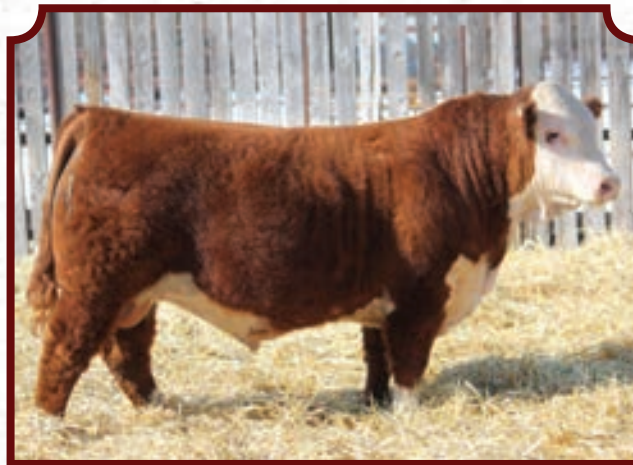
Glenlees 27C Kreed 3H